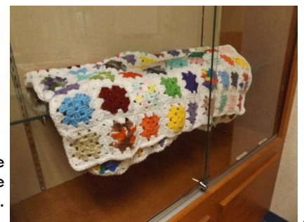
An afghan made recently in needle craft classes.