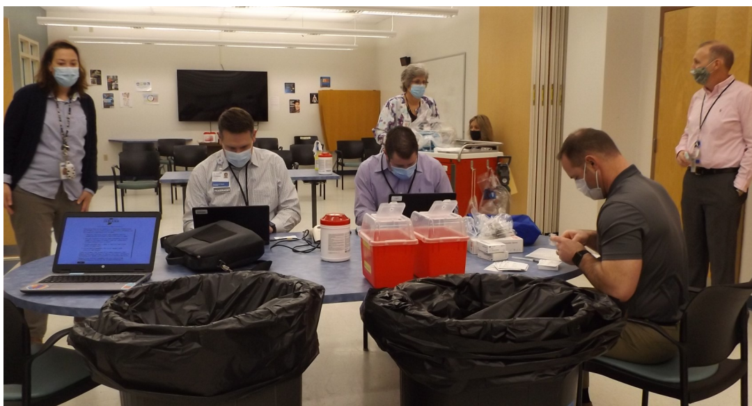
Staff from Ascension St. Vincent Evansville are pictured setting up in the Treatment Mall on February 25th for the first day of COVID-19 vaccinations of patients who have consented and fall in the eligible criterion. This was a collaborative effort by community partners including the Indiana Department of Health.