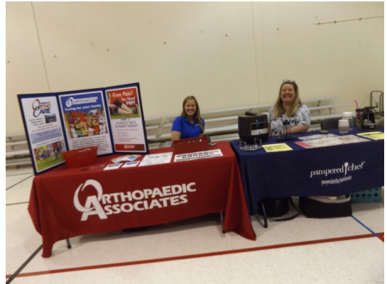
Vendors pictured participated in the June 5 Employee Health Fair in the gym.

Approximately 80 employees attended the annual health fair in June. "Health is Wealth" was this year's theme and focused on a healthy balance of good mental health, physical health, financial stability/wealth, community involvement and work satisfaction. Vendors included Planet Fitness, Bob's Gym, Orthopaedic Associates, Digestive Care Center, Tri State Colorectal Group, Smokefree Communities, Gilda's Club, Komen Evansville, United Way, E is for Everyone, Pampered Chef, Colonial Life, Old National Bank, and Indiana Public Retirement System. Employees received some nice giveaways and door prizes - restaurant and store gift cards, gym memberships, drink bottles, lunch bags, tote bags, Evansville Otters tickets, and BikeShare Upgrade coupons. The demonstration area included several stress relievers such as cooking, painting with dots, crocheting, wreath making, and gardening tips. A wellness survey was conducted which resulted in some interesting employee statistics: