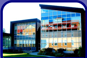
Madison State Hospital

Safely deliver meaningful, quality, and compassionate, psychiatric care to our patients and their families.