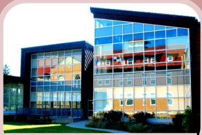
Madison State Hospital

Safely deliver meaningful, quality, and compassionate, psychiatric care to our patients and their families.