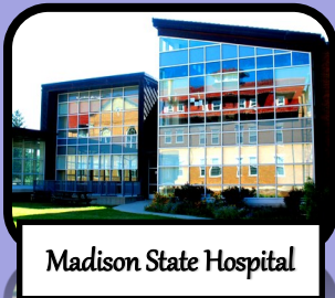
Madison State Hospital

VISION: Safely deliver meaningful, quality, and compassionate, psychiatric care to our patients and their families.