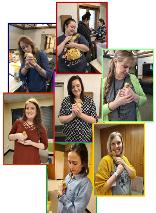
Pictured: EPCC staff cuddling with the baby ducklings