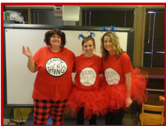
Pictured: EPCC teachers dressed up for Dr. Seuss Day!