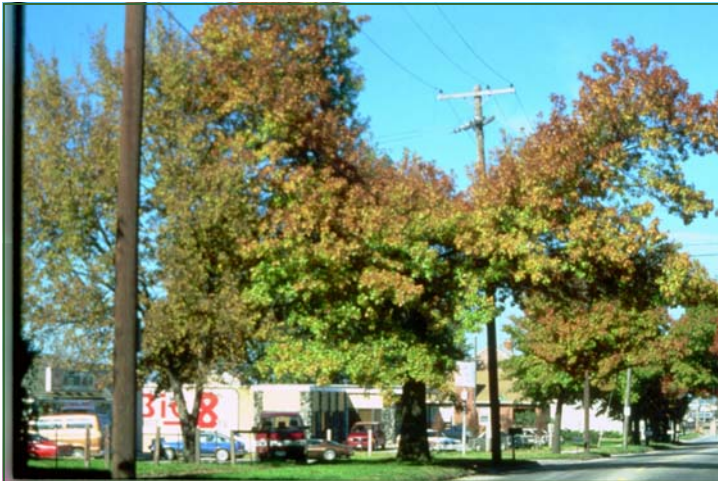
Mature tree pruned for line clearance