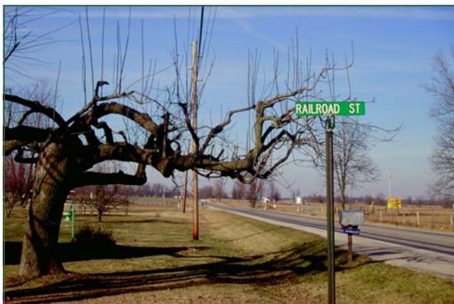
Tree topped for line clearance with sprouts that will become weakly attached branches