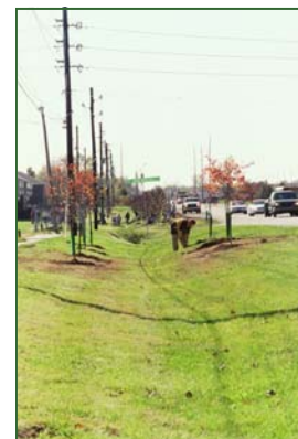
IPL, Tree Line USA, Trees and Power Lines Project

Read on for a list of Power Friendly Trees!