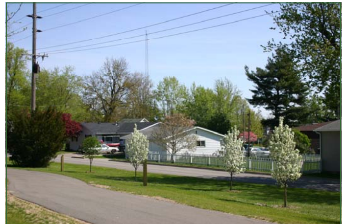
NIPSCO Tree Line USA Utility Arboretum in Middlebury

Don't plant trees with a mature height of over 25 ft. under or near power lines.