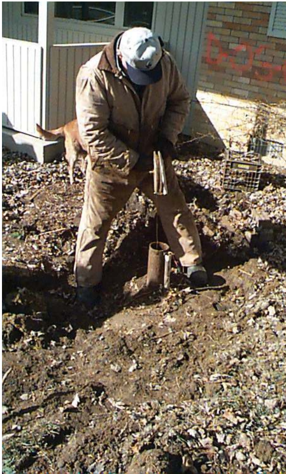
Well depth is determined by a licensed driller/pump installer prior to plugging.

Indiana Department of Natural Resources Division of Water 402 West Washington Street, Room W264 Indianapolis, IN 46204-2641