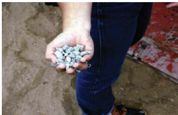
Bentonite material used for well plugging.

A water well that has not been used for more than three months but is not abandoned must be sealed at or above the land surface with a welded, threaded, or mechanically attached watertight cap.