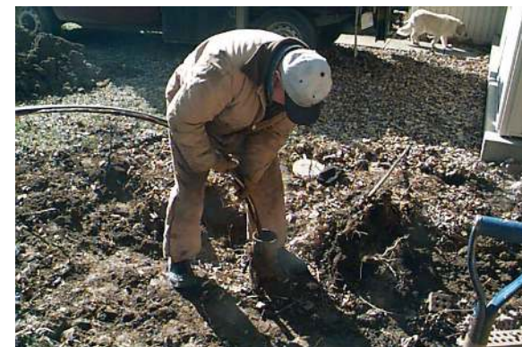
Pump being removed from a well by a licensed driller/pump installer prior to plugging.

Wells must be sealed at or above the ground surface with a welded, threaded or mechanically attached watertight cap. The Division of Water recommends that the well also be completely filled