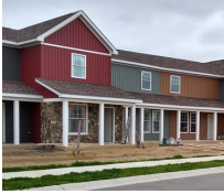
IHCDA: Paddocks Housing Update