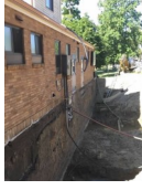
Beach Lodge Construction Update