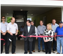
Sand Hill Farm Apartments Open!