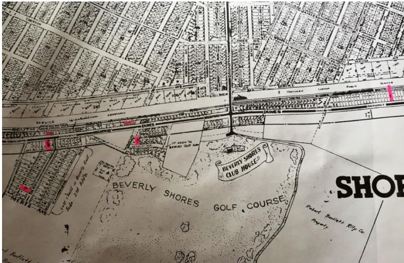
Lots (l.to r.) 15, 20, 12,18,16 and 9