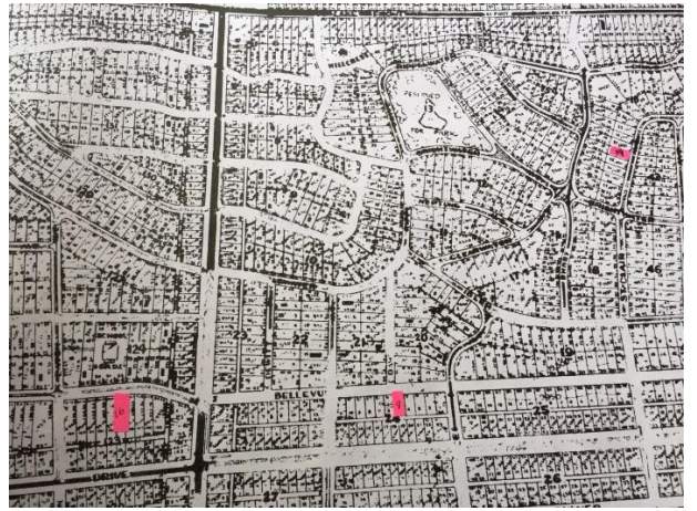
Lots (l.to r.) 16, 8 and 1.