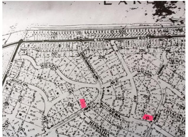
Lots (l.to r.) 3 and 11.