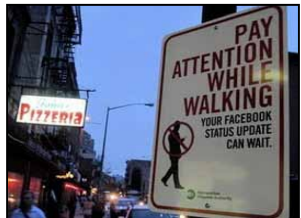
The ‘Metropolitan Etiquette Authority’ post this sign around New York City.

Distracted walking is a hazard that is not unique to the United States. Research conducted in both Japan and England show similar increases in this trend. An experiment was conducted in London’s busy Brick Lane which was identified as the top spot for London’s 68,000 texting accidents in 2007. Lampposts and other obstructions were wrapped and padded to minimize injury to pedestrians who texted and talked on cell phones as they walked. Cameras have been installed to capture pictures of people running into these obstructions and record incident frequency. The idea could be rolled out to other London texting hotspots if this trial is successful.