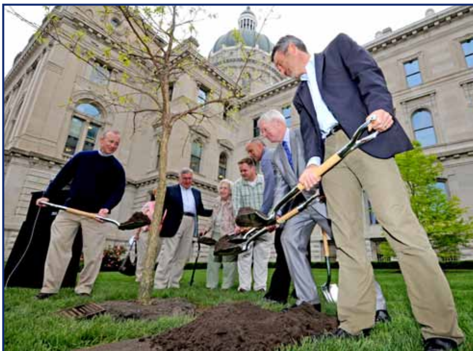
On Arbor Day, April 26, Governor Daniels plants a bur oak tree on the west lawn of the State House. The tree planted by Daniels was donated by Cardno JFNew.

Failure to submit documentation by June 1 may result in unauthorized leave for absences after June 30, 2012