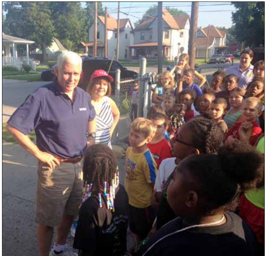
In Terre Haute, Governor Mike Pence and First Lady Karen Pence speak with kids from the Chestnut Community Center prior to the second "Walk a Mile" event to promote fitness and health among Hoosiers. To see more pictures of Governor Pence, visit http://in.gov/gov/2387.htm

Motorists, residents and businesses are encouraged to visit www.SouthSplit.in.gov to learn details of the project and sign up for project email updates. Updates will also be provided on the Indiana Department of Transportation East Central Facebook page and on Twitter @INDOT_ECentral .