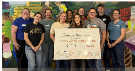
A group of interns at Gleaners.

Be sure to say hello to our interns around the State before they wrap up their internships in August.