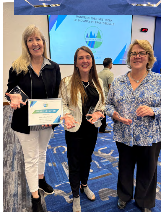
Indiana State Museum and Historic Sites accepts their PRSA awards