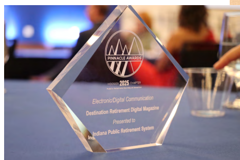
Indiana Public Retirement System accepts their PRSA award