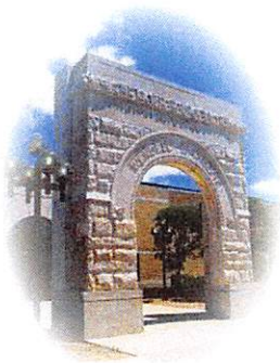
The Hope of Our Country