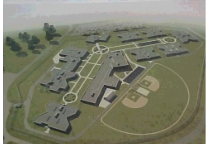
Pendleton Juvenile Correctional Facility

The Superintendents of Logansport Intake and Diagnostic Facility and Fort Wayne Juvenile Facility have developed survey instruments that are sent to various stakeholders in the juvenile offender system. Survey results will be used to ensure that programs are providing maximum effectiveness and efficiency.