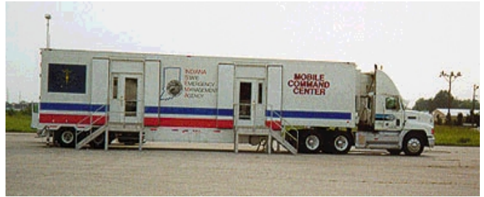
The SEMA Mobile Command Center

The Indiana National Guard has been very successful maintaining its strength, currently ranked 7 th in the nation. The 76 th Infantry Brigade (Separate) recently completed a very successful exercise at the Joint Readiness Training Center at Fort Polk, Louisiana. This involved several years of rigorous training to test the proficiency of every soldier, leader, procedure, and system. The Brigade moved its equipment by barge, rail, and plane. 7,434 76 th Infantry Brigade (Separate) and 38 th Infantry Division soldiers were involved. Indiana is one of only two states that have both an Enhanced Brigade and an Infantry Division. Indiana is the only state with a major National Guard training site and two Air Gunnery ranges.