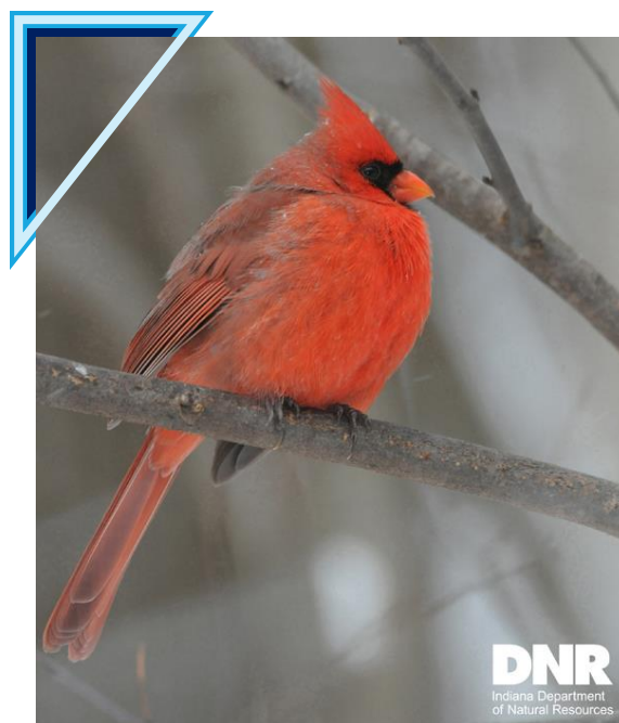
Indiana Cardinal

Once you have assembled your initial list of people and organizations, invite team members to an introductory meeting . Iterate the goal of reviving a sense of community and discuss how all members' knowledge will ensure a flourishing recovery. Official team members will be chosen after this initial meeting, and selection should be based on insight and availability. Your committee should meet regularly: whether that is weekly, monthly or weekly during the first few months is up to you. We recommend starting with a small handful of people and later adding members to bring specific expertise as the process evolves.