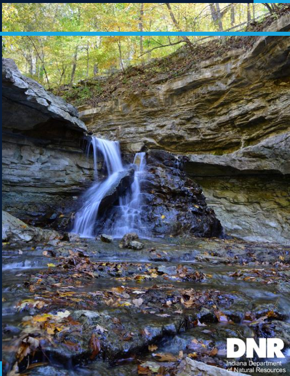
McCormick's Creek State Park, DNR

Currently, Treasury guidance does not explicitly prohibit repayment being made with either tranche of CLFRF. However, due to the brief period between final notice and recoupment, and recoupment being outside the scope of the four categories bulleted on page 4 , OCRA strongly urges against using any funds conceived by the American Rescue Plan as a source of recoupment, especially Coronavirus Local Fiscal Recovery Funds.