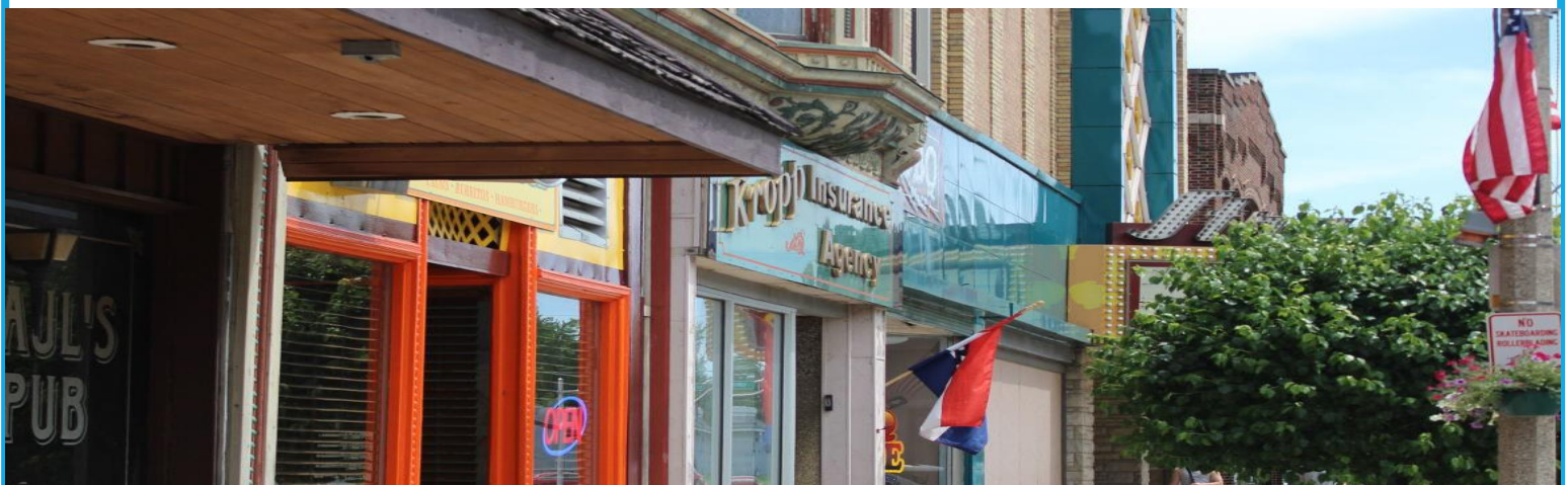
Downtown Kendallville