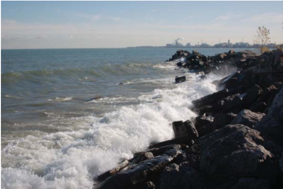
Rock shoreline along Lake Michigan at Whiting Lakefront Park

The condition of the shoreline extending the width of Whiting Lakefront Park from the breakwater at the Whihala boat ramp to the fishing pier is an important issue. The existing rock, concrete, and debris along the shoreline extending from the Whihala boat launch harbor to the pier is dangerous and unsightly. The condition of the shoreline detracts potential park users.