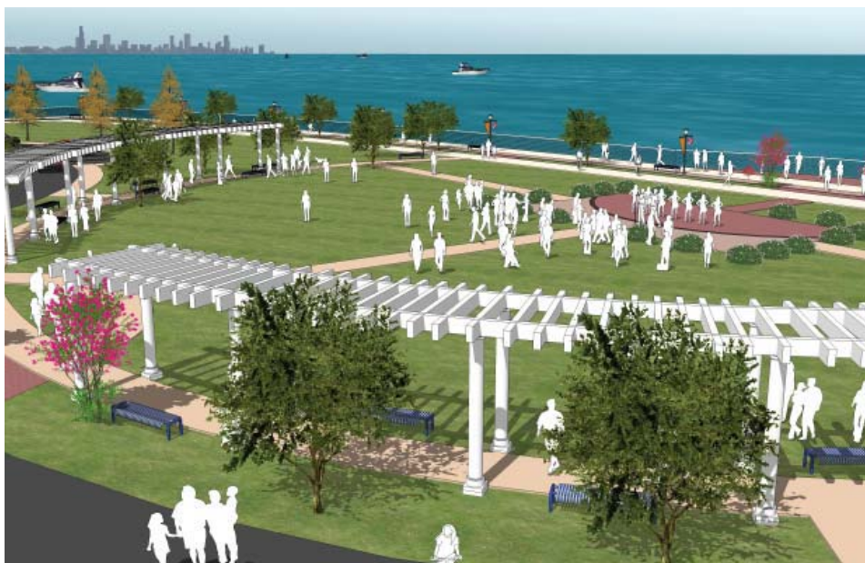
Proposed formal garden and gathering space along the lakefront