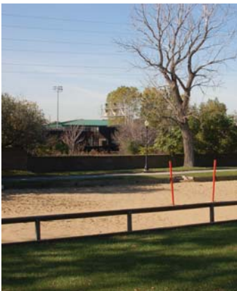
Sand volleyball courts at Whiting Lakefront Park

The pavilion is located central to the interior of the park. It serves the community year round with events and performances. The building is in need of some minor repair, and the restrooms facilities located in a building to the rear are no longer adequate. The performance area space is limited inside the pavilion. Park guests view performances from the hillside to the south, but seating is limited. It becomes difficult for audiences to see inside the building during events as they wrap around the pavilion. There is no concession stand in the park at the present time.