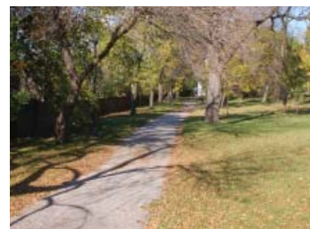
Trail system in Whiting Lakefront Park