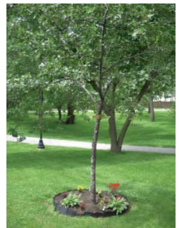
Landscape features in Whiting Lakefront Park

The condition of the shoreline extending the width of Whiting Lakefront Park from the breakwater at the Whihala boat ramp to the fishing pier is an important issue.