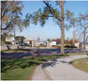
Whihala Beach entrance