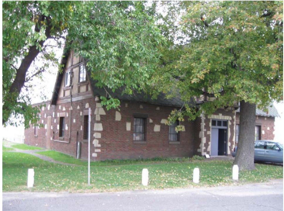
Gun Club in Whiting Lakefront Park