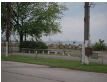
Road through Whiting Lakefront Park