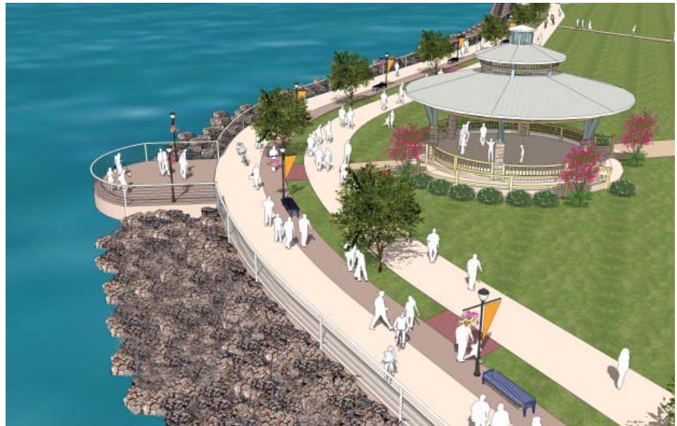
Proposed lakefront promenade and gazebo

Whiting is a close-knit and vibrant community built upon the industriousness of its citizenry. It prides itself on its historic park, which serves as a center of recreation for residents and visitors alike. The City sees its park as an easily accessible and inviting retreat for year-round recreation and a place to commune with fellow neighbors and nature alike. In the spirit of the Marquette Plan, it provides for pedestrian and bicycle connections to a regional trail network and a safe and engaging connection for people to visit the Lake Michigan waterfront. It is a park that exemplifies the richness and vitality of Whiting and its citizens—a place to celebrate, a place to contemplate, and a place to play.