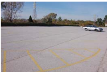
Parking area at Whihala Beach