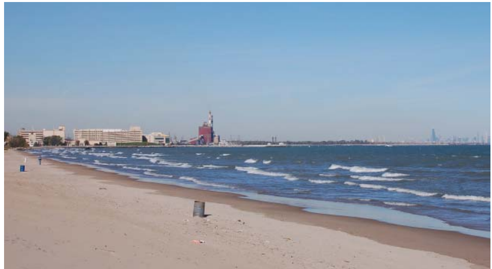
Beachfront at Whihala Beach

The Chicago skyline and Lake Michigan provide an excellent backdrop to Whiting’s shoreline and make Whiting Lakefront Park a popular destination for residents and tourists.