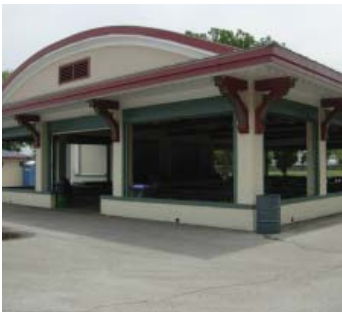
Pavillion in Whiting Lakefront Park