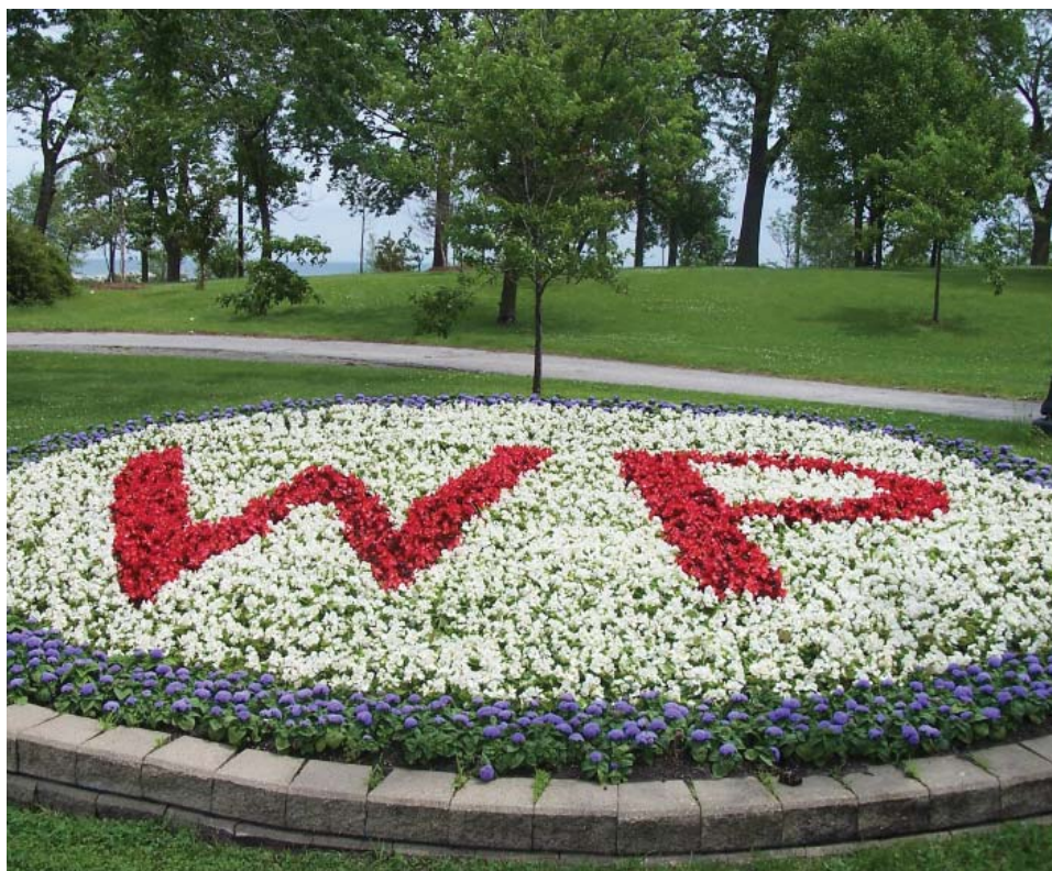
Flowerbed in Whiting Lakefront Park