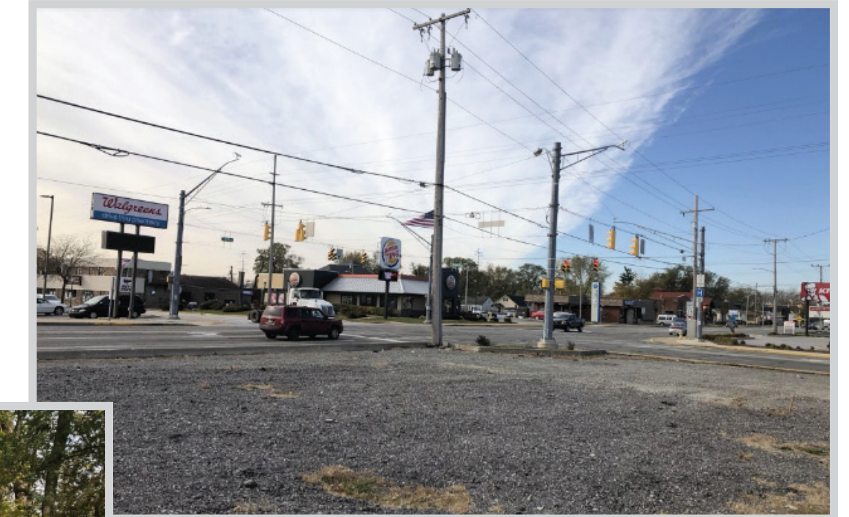
169th and Kennedy Ave. (Hammond)