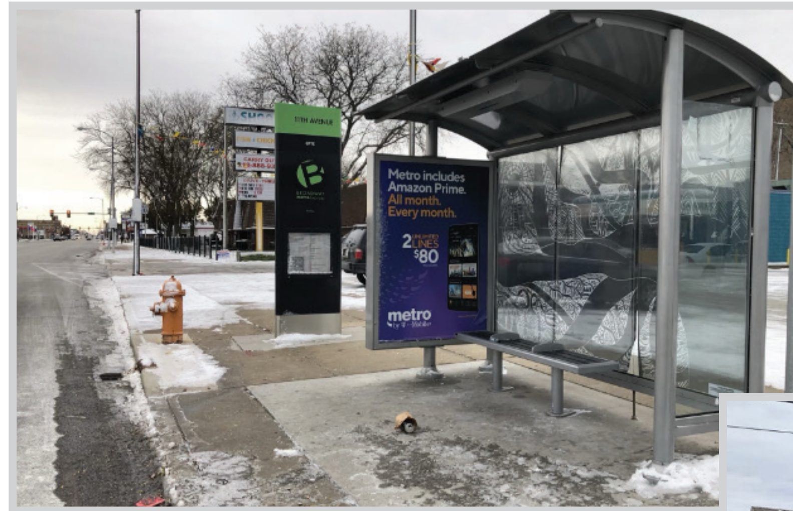
Broadway and 11th Ave (Gary)