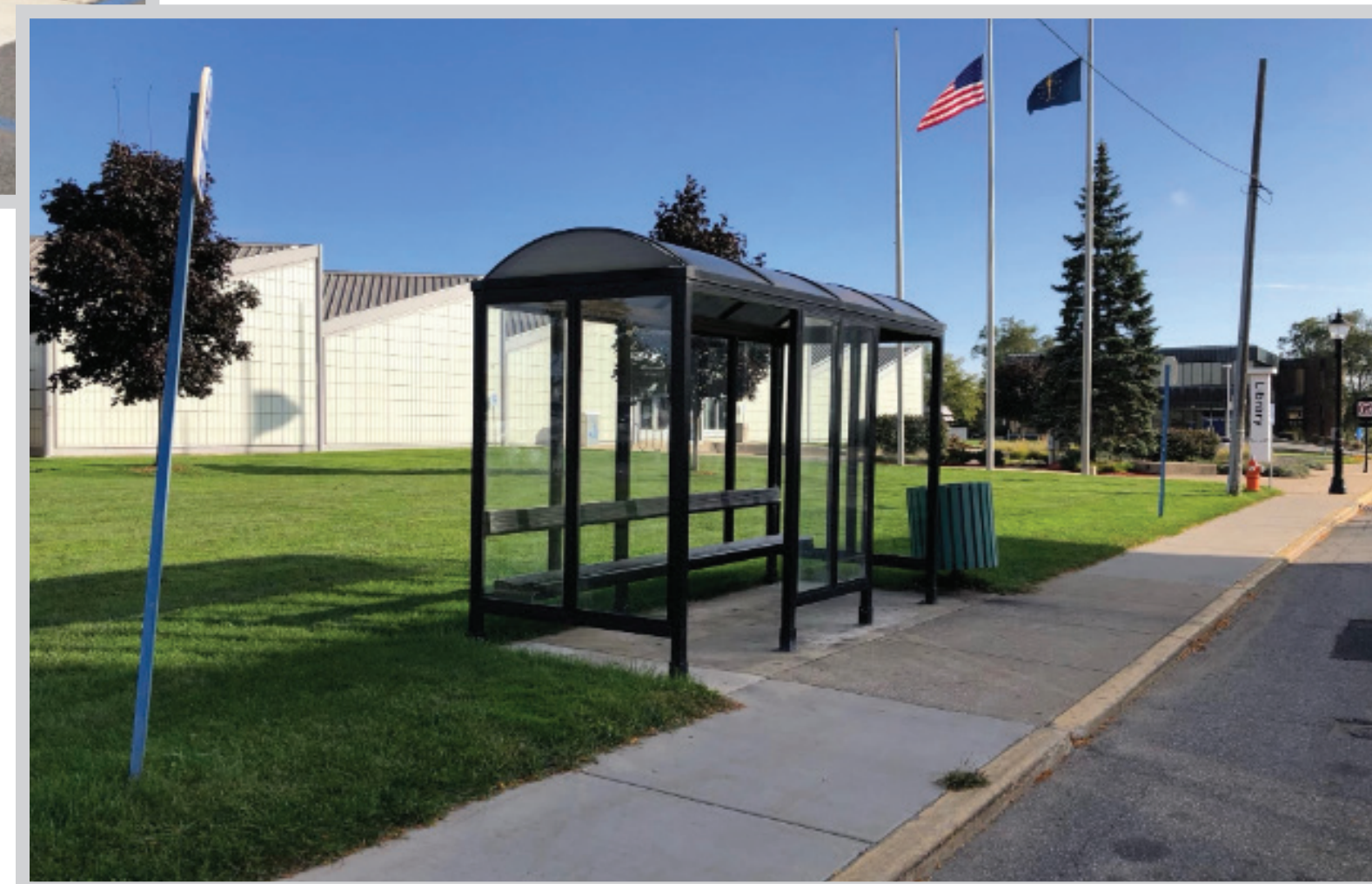
Michigan City Public Library (Michigan City)