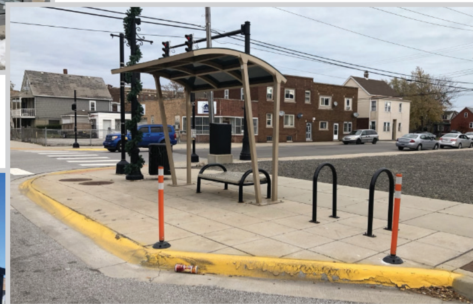
Main and 140th Street (East Chicago)