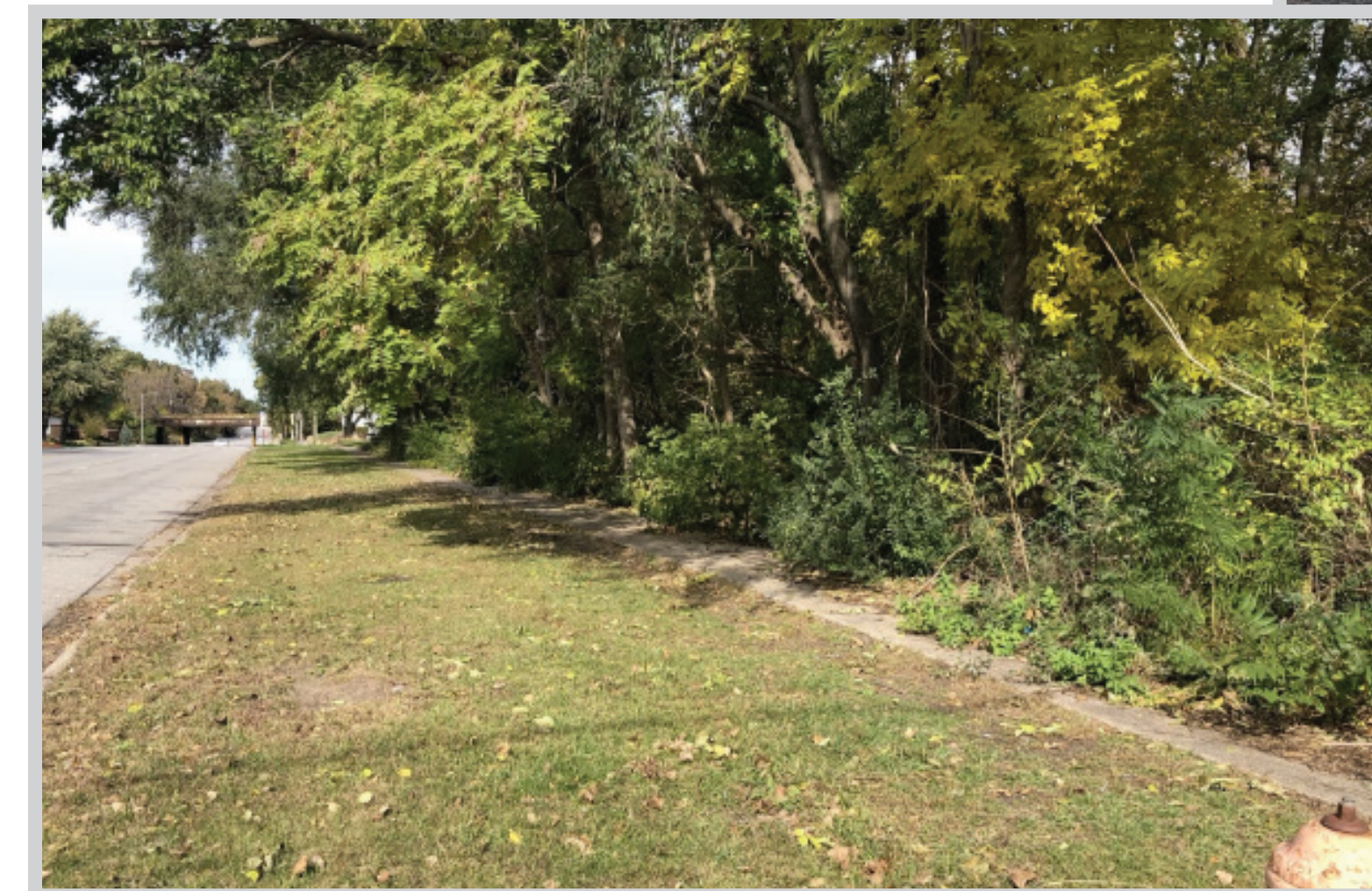
4th and Grand Blvd. (Gary)