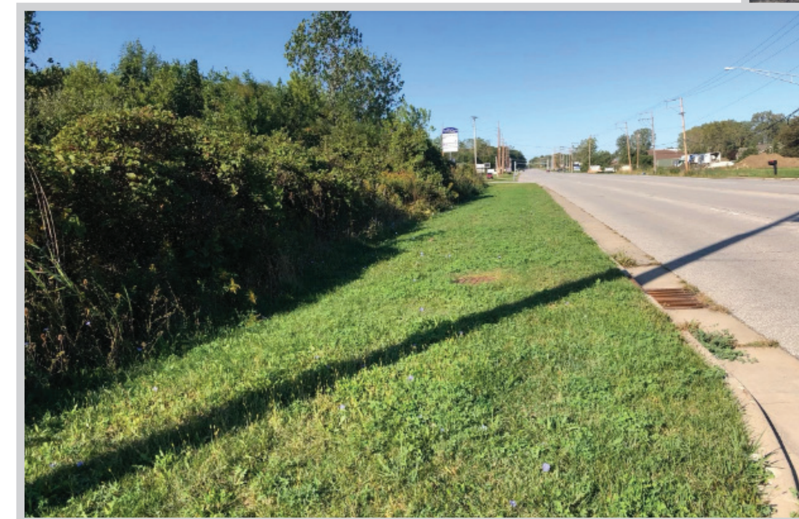
W 400 N (across from King's Inn) (Michigan City)