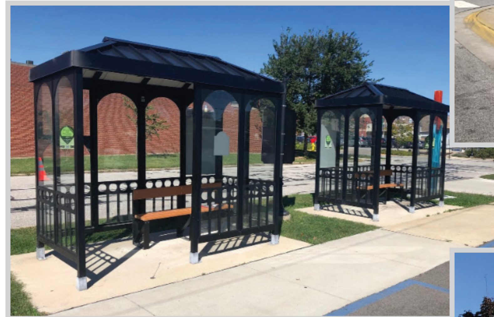
Michigan Ave. and Indiana Ave. (Valparaiso)