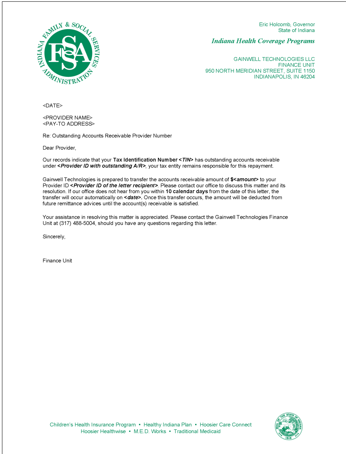
Figure 25 – Transfer Letter