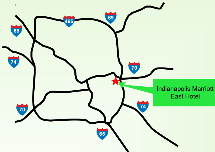
Indianapolis map showing location of Indianapolis Marriott East Hotel