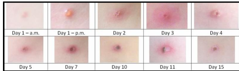
The Chickenpox Rash Over 15 Days

Chickenpox is a highly contagious illness most common in children. It is usually a mild childhood rash illness, but it can cause serious complications, including pneumonia, inflammation of the brain tissue or inflammation of the coverings surrounding the brain and spinal cord, bacterial skin infections, and even death. Complications are more likely in older adults and those with weakened immune systems.