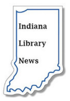
EVPL offering space for telehealth appointments

Concerts are held from 6-10 p.m. on the Main Library plaza at 900 Library Plaza in Fort Wayne.