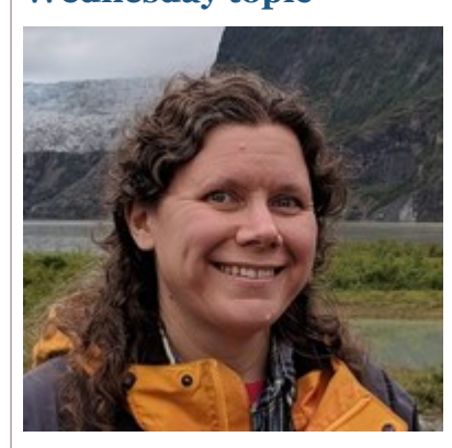
As part of the Indiana State Library's What's up Wednesday

'Effective Staff Development on Any Budget' announced as April What's Up Wednesday topic