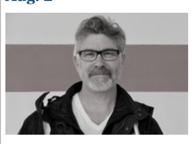
Join the <u>Indiana Center for the</u> <u>Book</u> and the <u>Rhode Island Center</u>

Reimagining School Readiness Part One; p.m. option When: Aug. 16, 1:30-3:30 p.m. Where: Webinar