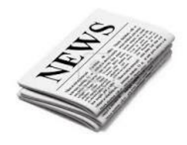
Email your news for inclusion in The Wednesday Word