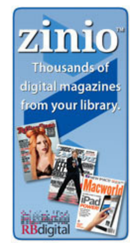
Click here for access to 1,000's of magazines

© 2015 Indiana State Library. All rights reserved. The trademarks used herein are the trademarks of their respective owners.