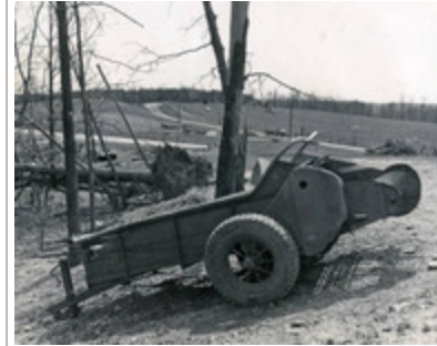
Tornado damage in Crawford County, 1974.

April 3-4 will mark the 50th anniversary of the 1974 Tornado Super Outbreak. This key event in U.S. weather history saw 148 tornadoes across 13 states. More than 300 people were killed. Significant improvements in weather technology and systems developed in the aftermath of the storms.