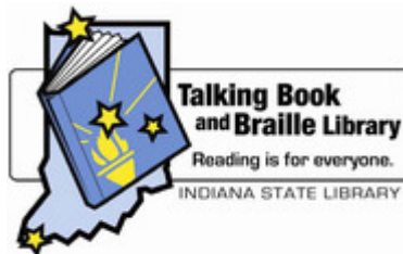
Click the image to visit the ISL Talking Book and Braille Library page

District 8 Conference - April 7, Morrison-Reeves Public Library, Richmond