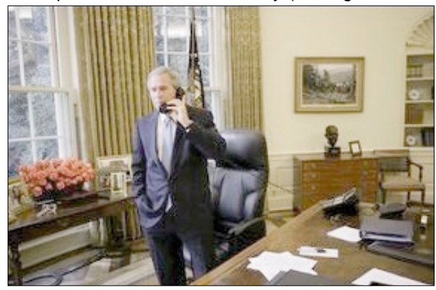
or NFL stadium suicide bombings, President Bush receives a congratulatory phone call from or nuclear plants destroyed, one had to wonder whether people

was behind a university lectern and not in a cave) the initial analysis was that no one knew what impact it would have. Then Gallup published numbers on Monday that suggested President Bush's lead on the terror issue was sliced in half, and there was the spectre that bin Laden might influence the election with pictures and words, not bombs. But on Election Day, when it became clear there would be no subway or nuclear plants destroyed, one had to wonder whether people had asked themselves. "Are we