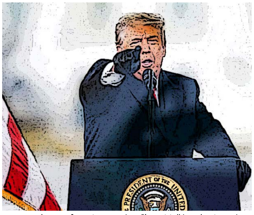
dozens of senators running. I'm not talking about running for reelection. They were running for their lives, running

The House impeachment managers had obtained internal Capitol video from the Jan. 6 insurrection, showing