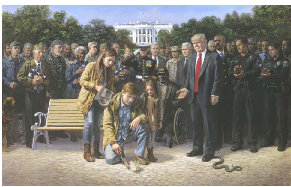
President Trump depicted in a painting by artist Jon McNaughton.

Obamacare: Since Trump took office, 2.3 million Americans have lost their health insurance coverage. Indiana had 140,931 people enrolled in private individual market plans through the Indiana exchange during the open enrollment period for 2020 coverage. That's down about 35% from the exchange's peak in 2015, when more than 218,000 people enrolled. According to the IndyStar in October, more than 572,000 Indiana low-income