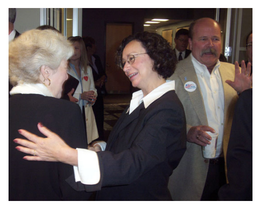
Democrats Julia Carson (left) and Vi Simpson made Indiana General Assembly history.

that served in that body in the 109th and 110th (1994-1998), and the 13 that served in the 116th (2008-2010). It's worth noting that the General Assembly from 1990 to 2010 saw an average of 13 female senators and 16 female representatives; since 2010, the number of representatives has grown to an average of 23 (an increase of 43%), but the number of female senators has dropped to an average of nine (a decrease of 30%).