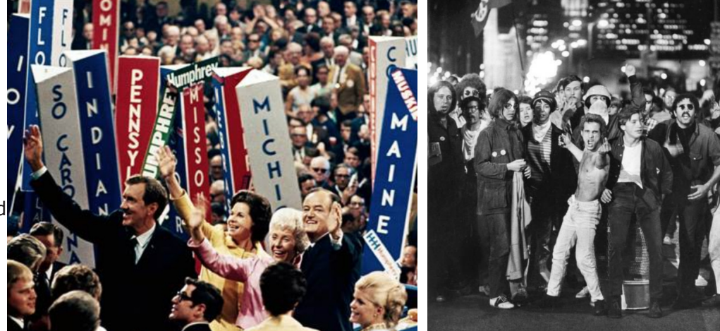
The Humphrey-Muskie ticket at the 1968 Democratic National Convention as the Windy City seethed in rebellion and a police riot outside.

Protesters, including those most radical and intent on disruption, were forced from the park and went streaming to the Loop, causing damage and mingling with delegates, the young McCarthy supporters and others who were breaking no laws. This led to what was described lat-