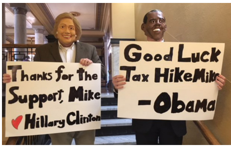
The Rokita campaign had people dressed as a milk carton following Messer and as Hillary Clinton and Barack Obama following Braun.