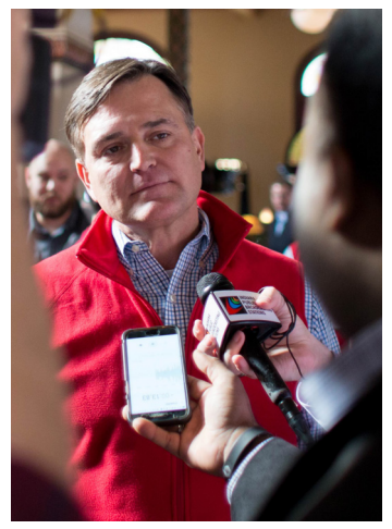
straw poll interview.

Asked when Hoosiers will begin seeing the tax cut in their paychecks, he said, "Folks should see more in their take- home pay in February. The withdrawals will be made by then. If you're a middle class family making $70,000 a year, your tax cut is between $1,000 and $2,000. Working families will be better off. I'm a child of the '80s. In the movie 'Star Wars' they had this thing called the Jedi mantra, when the droids tried to convince you that the reality wasn't true. The problem for