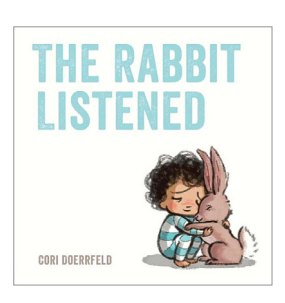
The Rabbit Listened by Cory Doerrfeld