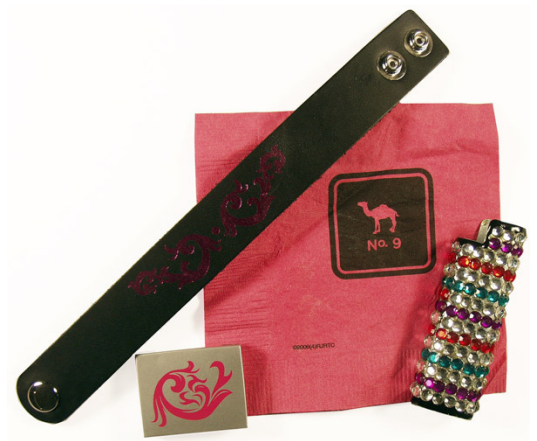
Left: Camel Snus direct mail ad