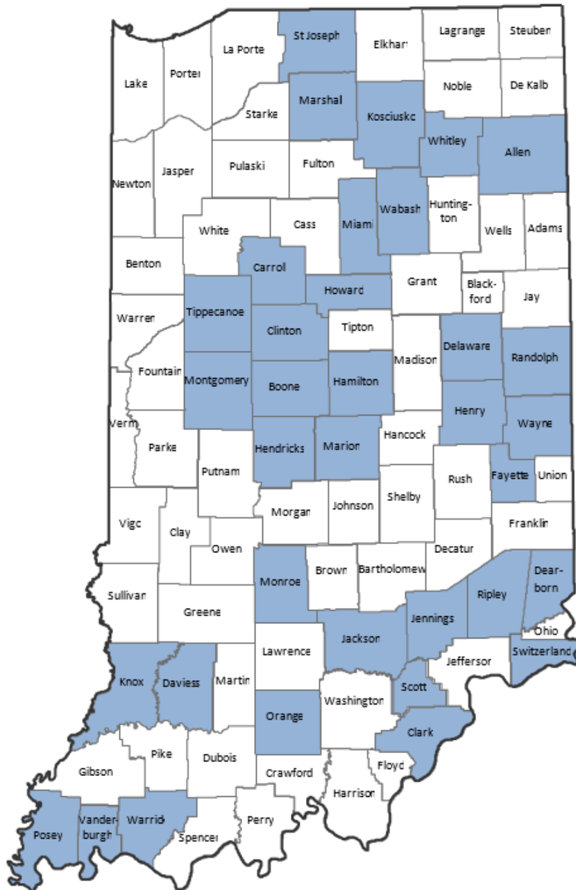
Figure 1 shows a map of counties which have local health departments participating in this third round of naloxone kit distribution. These counties are highlighted in blue.