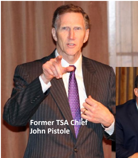
Former TSA Chief John Pistole