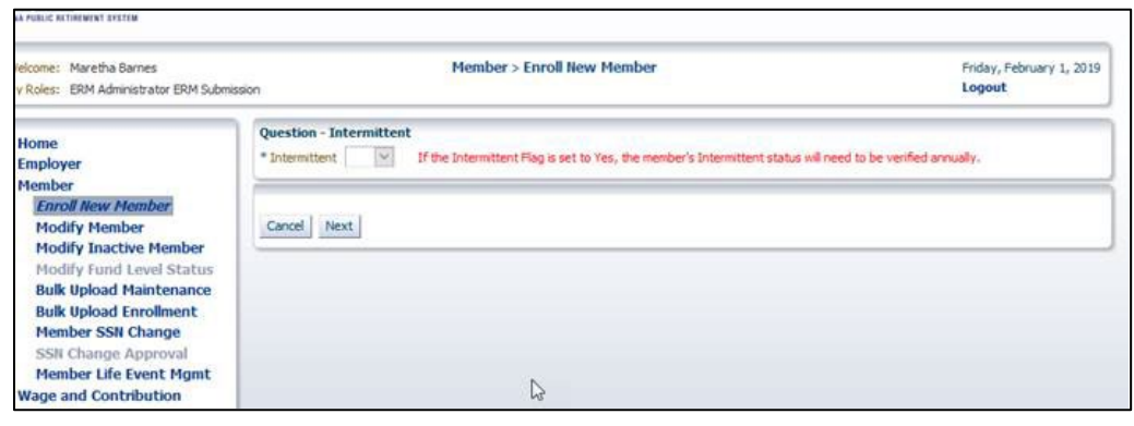
Figure 2: Intermittent Screen