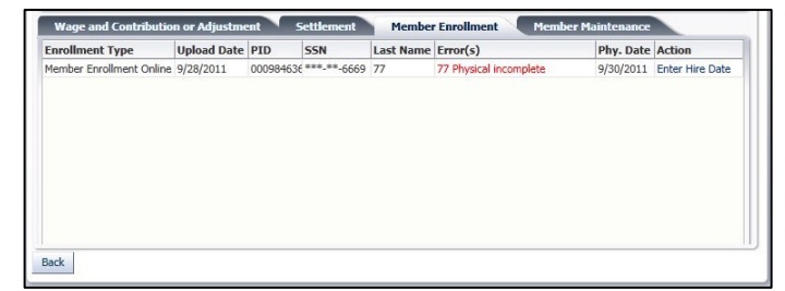
Figure 4: Member Enrollment Exception Queue

7. A screen message displays stating that 1977 Fund enrollments are sent to the Member Enrollment Exception Queue in Pending status until results of the Statewide Baseline Examination are received. Once INPRS receives the results, INPRS Staff will contact you to complete the enrollment.