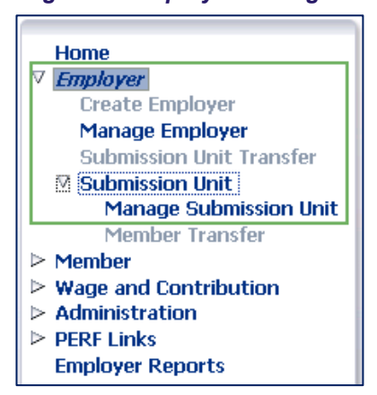
Figure 2: Employer Management Functions