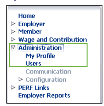
Figure 5: Administration Functions

New Employer Users can be created by clicking on the Users link. Detailed instructions for completing this administration function can be found in the Employer Reporting and Management (ERM) Employer Management User Manual .