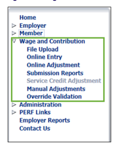
Figure 4: Wage and Contribution Functions

Detailed instructions for completing these wage and contribution functions are found in the <u>Employer Reporting</u> and Management (ERM) Wage & Contribution User Manual.