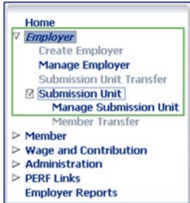
Figure 2: Employer Management Functions