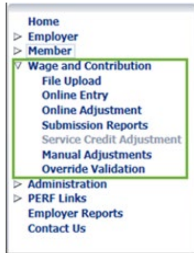
Figure 4: Wage and Contribution Functions

Detailed instructions for completing these wage and contribution functions are found in the Employer Reporting and Management (ERM) Wage & Contribution User Manual .