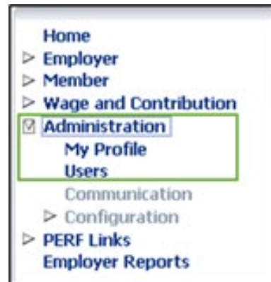
Figure 5: Administration Functions

New Employer Users can be created by clicking on the Users link. Detailed instructions for completing this administration function can be found in the Employer Reporting and Management (ERM) Employer Management User Manual .