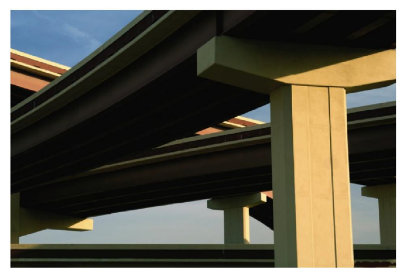
ON-THE-JOB TRAINING PROGRAM & PARTNERSHIP AGREEMENT