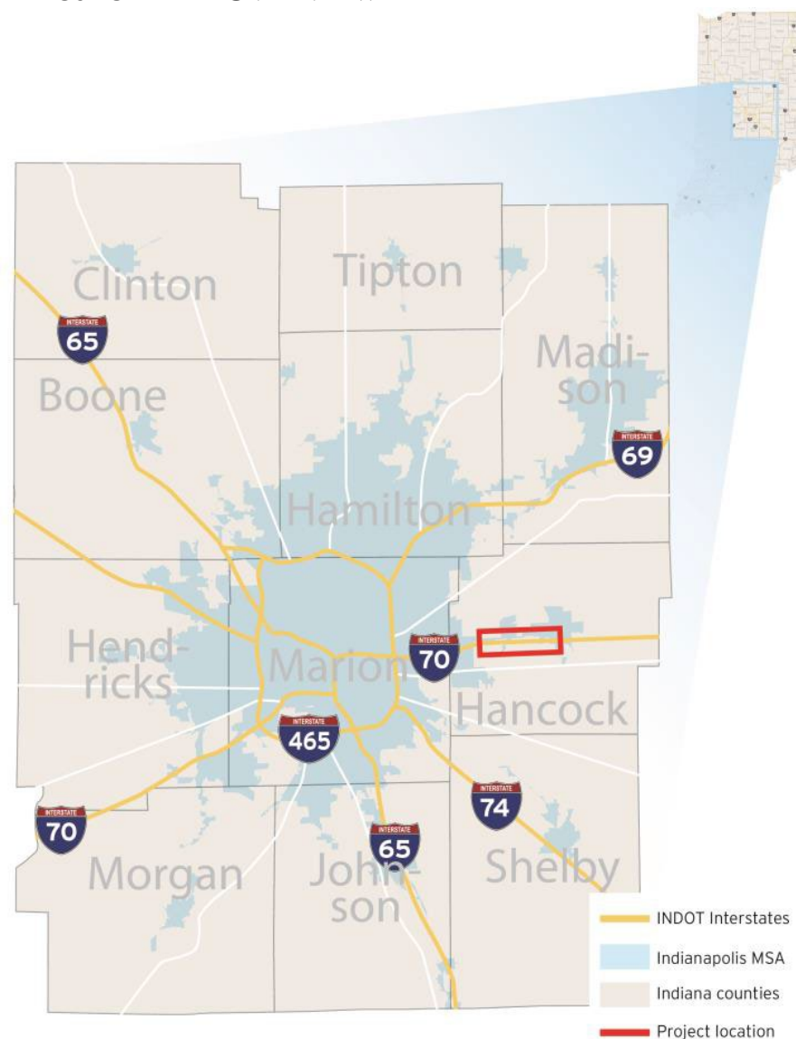
FIGURE 1-1. PROJECT MAP OVERVIEW

From an environmental standpoint this project strictly follows the NEPA documentation process and guidelines. A NEPA Final decision has been achieved as of the preparation of this FPAU.