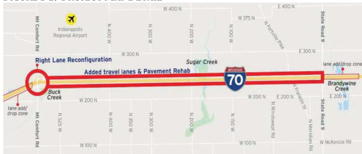
FIGURE 1-2. PROJECT MAP DETAIL

The Categorical Exclusion-4 was approved in May 2021.