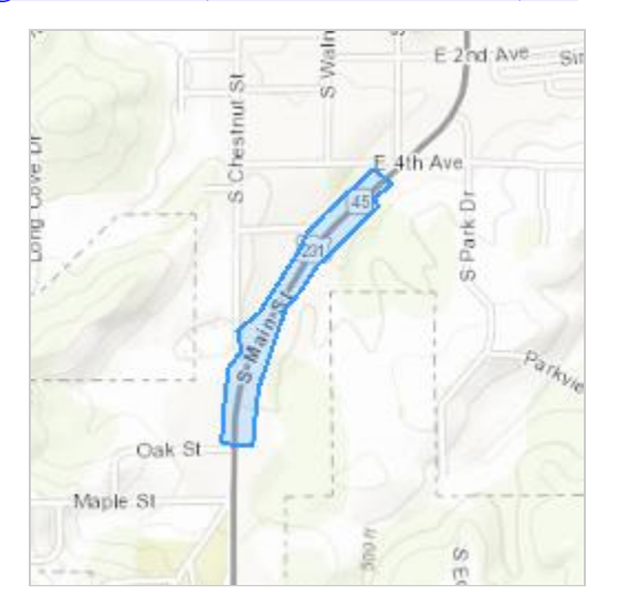
Counties: Dubois County, Indiana

Approximate location of the project can be viewed in Google Maps: <u>https://www.google.com/maps/@38.28398385,-86.96003979172798,14z</u>