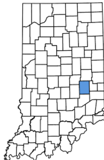
Figure 1: Rush County - Blue

The County recognizes that ISPs must make a profit in their proposed networks. However, the county clearly recognizes that there is a vast difference between availability and affordability. To this end, the proposal should ensure that the minimum offering will meet the 25/3 requirements and will be affordable to the vast majority of citizens. At a conceptual level, the minimum standard of service should probably be in the $65/month range.