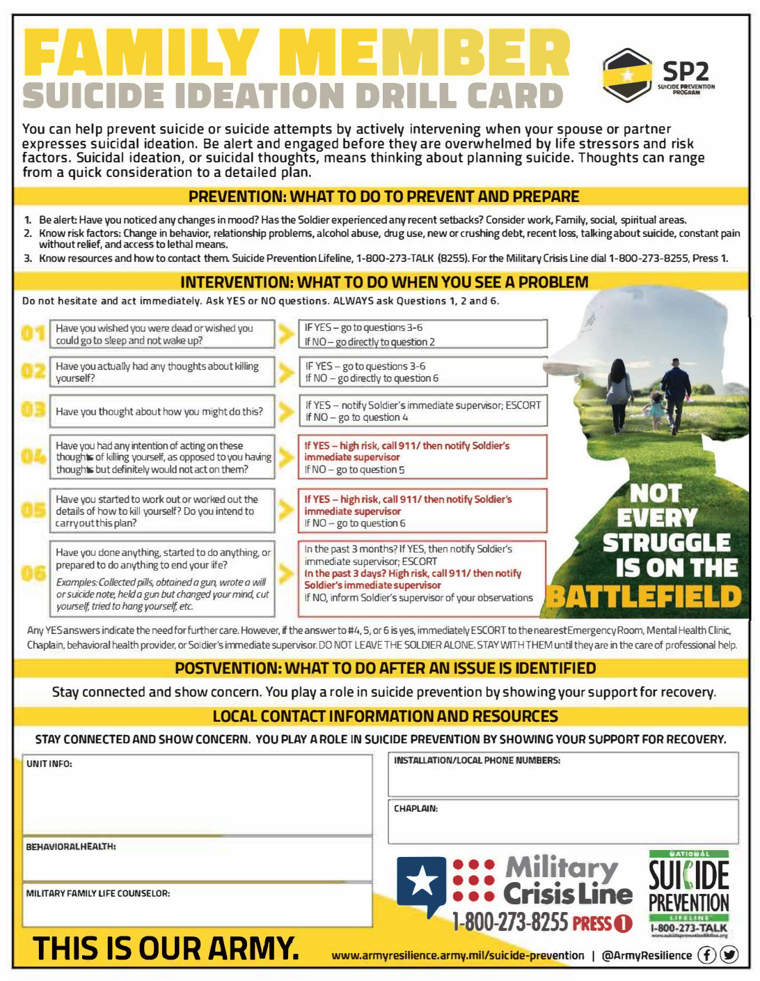
Figure B-3. Family Member Suicide Ideation Drill Card